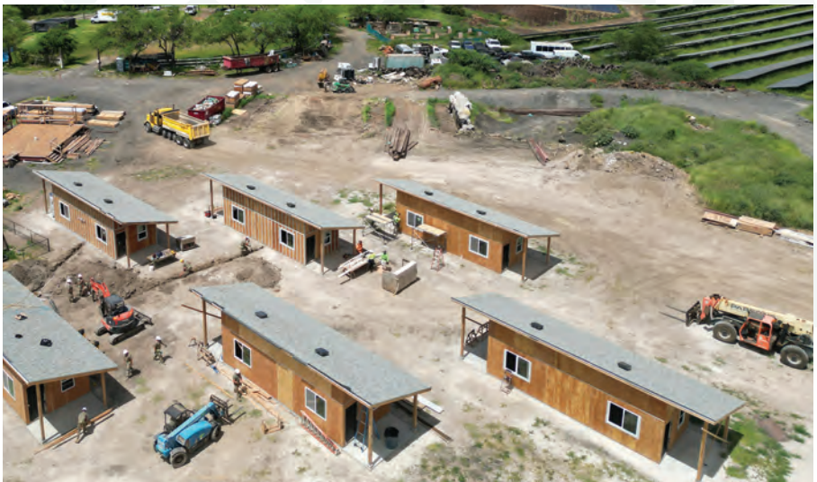
After hearing from community leader Twinkle Borge at the 2022 conference, a group of HEC members rallied to help support Pu'uhonua o Wai'anae. Together, they were able to leverage their influence and connections to reach their $10M fundraising goal to help complete the first phase of the village. This success showcases the power of HEC in driving meaningful impact by aligning with and helping to accelerate a community's goal. Pictured are some of the first buildings from phase one.