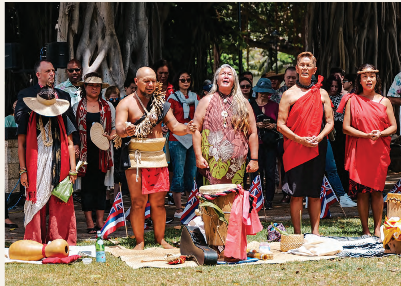
To help support the Lahaina recovery effort, HEC held a neutral convening for leaders that resulted in new relationships and partnerships to benefit their community.